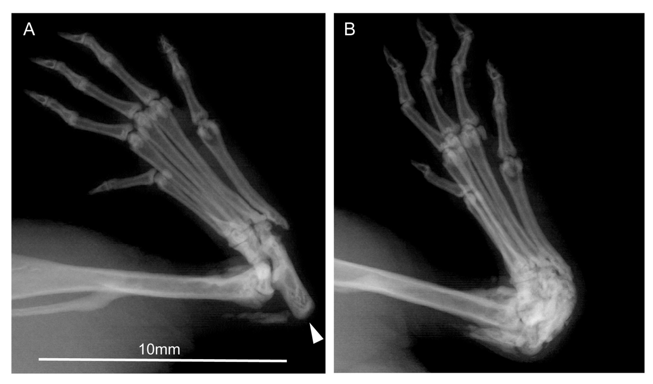
Fig 2. (a) X-ray image of the normal position of the calcaneus (arrow) within the tarsal joint and (b) with caudo-dorsal dislocation of the calcaneus.

https://doi.org/10.1371/journal.pone.0230162.g002