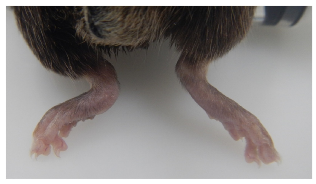
Fig 1. Dorsal view of unaffected right tarsus and rounded, swollen tarsus (reader's left).

C57BL/6N mice bred for the IMPC late adult phenotyping program were examined for tarsal injuries at five international mouse research centres. These mice included GA strains from a wide range of mutant lines examined by the IMPC as well as baseline wild type controls. Due to differences in individual institutional protocol, the ages of the cohorts vary. The frequency of occurrence was between 1.7% and 12.1% of male mice examined between the ages indicated