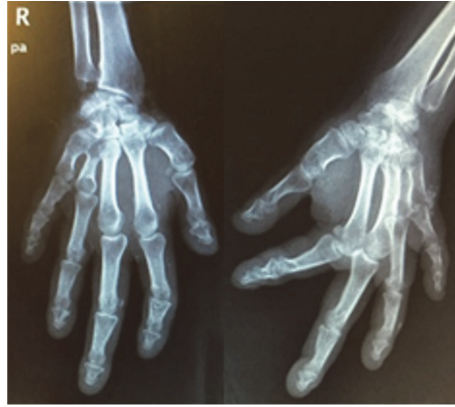
FIGURE 1: Radiography of both hands, revealing brachydactyly of the fourth and fifth metacarpals.