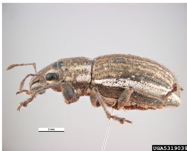
Figure 1: Naupactus leucoloma

Yes. The identity of Naupactus leucoloma Boheman is established.