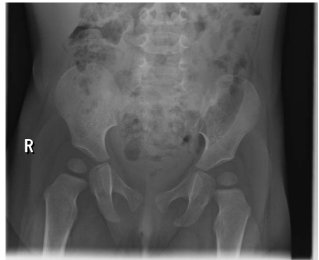
An anteroposterior pelvis radiograph of a 2-year-old woman with developmental dysplasia of the hip, assessed at a community facility. She received 6 months of brace treatment beginning at 3 months of age.

uptake and lags behind other sectors. On a global scale, new technology and clinical workflows have already been adapted to support alternative care delivery. Small, simple changes within existing health services and structures that do not require extensive transformations to operations are both time and cost-effective. The need for improved solutions and better alternatives to antiquated health systems became apparent with the COVID-19 world outbreak. The COVID-19 global pandemic has greatly accelerated the use of telehealth services and demonstrated that political, security and financial barriers should no longer limit the healthcare system in providing more technologically advanced health services. One can only wonder how some countries would have better fared in their pandemic response had simple virtual technologies such as teleradiology services already been in place. Nevertheless, expansion and improvement in telehealth services will be crucial in protecting patients against existing and other future infectious diseases.