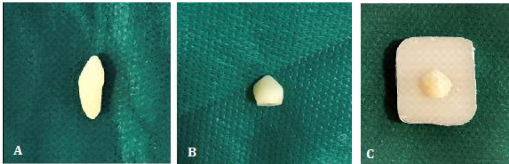
Fig. 1. Preparation of samples: (A) tooth selection, (B) cutting the crown at the cemento-enamel junction, (C) mounting the tooth in acrylic resin

drops is to dilute them with fruit juice, which often leads to their better acceptance by children as well [6,7]. Pediatricians recommend daily use of apple juice by infants starting at 6 months of age [7].