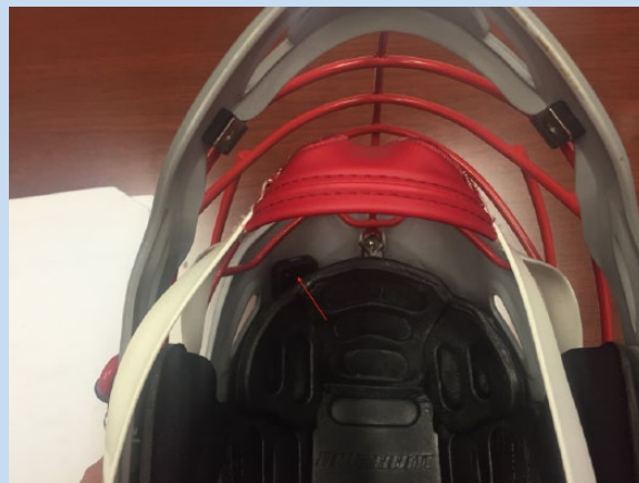
Figure 1. Sensor location.

All players wore the Warrior Sports Regulator II helmets instrumented with a GForce Tracker (GFT) sensor affixed internally to the crown of the helmet (Figure 1). The GFT contains a triaxial accelerometer and triaxial gyroscope to