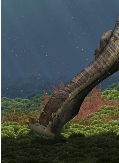
Fig. 3. Artist's restoration of A. unicus depicting it as a herbivore grazing on marine plants growing on a hard substrate in the eastern Tethyan Sea during Middle Triassic times. Using batteries of spatulate teeth lining the hammerhead expansions of both the upper and lower jaws, it would have been able to scrape off numerous pieces of plant matter into suspension in the water. This could then be sucked in and filtered by the long, thin, and closely packed needle-shaped teeth lining the main jaw rami. [Illustration: Y. Chen, Institute of Vertebrate Paleontology and Paleoanthropology]

With the new specimens on hand, closer examination of the holotype WIGM SPC V1107 shows that, in essence, the dentary is of a pronounced T shape [Fig. 2, A and B, of (5)]. In addition to the lateral process, the dentary also turns sharply inward to form the symphysis with its counterpart. The teeth on the dentary appear to have been arranged in a single row, extending from the symphysis along the entire anterior edge of the bone to the extremity of the lateral process before flexing back along the posterior margin of the process and then extending posteriorly along the main anteroposterior axis of the skull. As a consequence, the dentary has a double row of teeth on the lateral hammerhead process as can be seen in the holotype. The teeth on the maxilla extend as a single row along the entire lateral process and then turn sharply backward. The portion of the maxillary tooth row on the hammerhead process thus occluded between the two dentary tooth rows on the counterpart process.