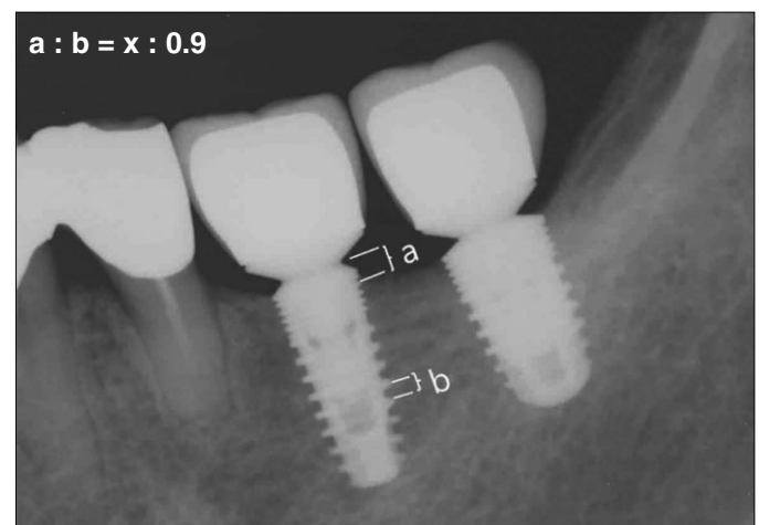
Fig. 1. Possible distortion was accounted from the true dimension of the implant. The proportional expression to calculate the amount of marginal bone level change is shown on the upper left part of this figure (a: distance between fixture-abutment interface and the first visible bone to implant contact measured from radiograph b: pitch distance measured from radiograph x: assumed amount of real bone change, 0.9: pitch distance between macrothreads).

The radiographs were taken perpendicular to the long axis of the implants with a long-cone parallel technique. The crestal bone level was measured from the fixture-abutment interface to the first visible bone-to-implant contact (BIC). The authors calculated the change in the crestal bone level using the original dimension of the inserted implants. The pitch distance between macrothreads of Inplant™ was 0.9 mm. The true crestal bone level was calculated through the proportional expression using the actual and radiographically measured values of the macrothread pitch (Fig. 1). The crestal bone level at the time of delivery of the final restoration was regarded as a baseline. The marginal bone loss was defined as the difference between the true crestal bone levels at the baseline and each appointment. It was measured at both the mesial and distal aspects of each implant. 19 A single investigator performed the radiographic analysis.