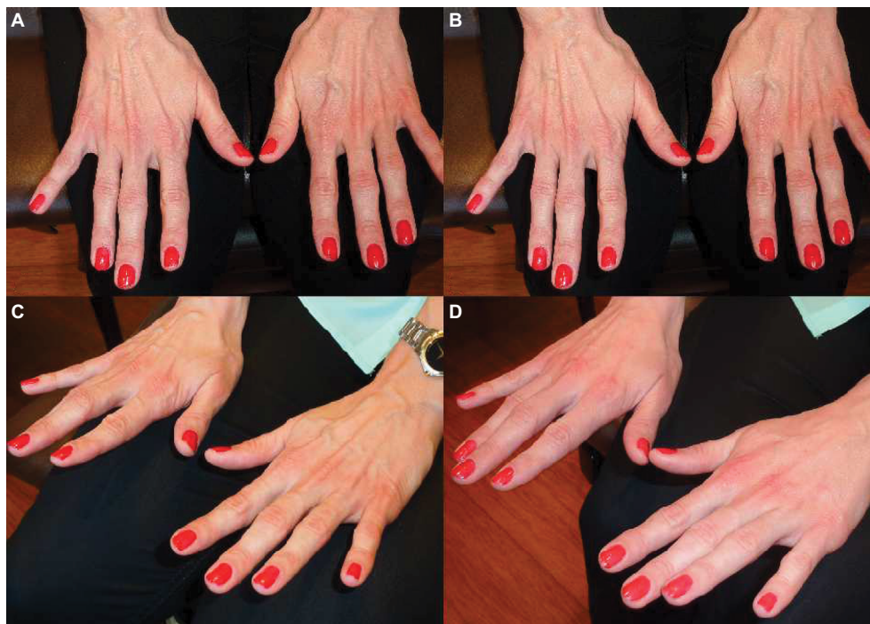
Figure 3 Before (A and C) and one year after (B and D) hand augmentation with 4 cc of diluted VYC-20L HA gel. In my experience, the result lasts for an average of one and a half years.

The author has not yet seen serious or long-term complications from hand rejuvenation with fillers, although granuloma