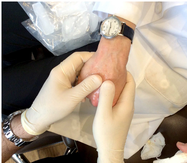
Figure 4 Vigorous massage after injection blends the injected product into the empty spaces of the hand so that the final contours are smooth and natural in appearance.