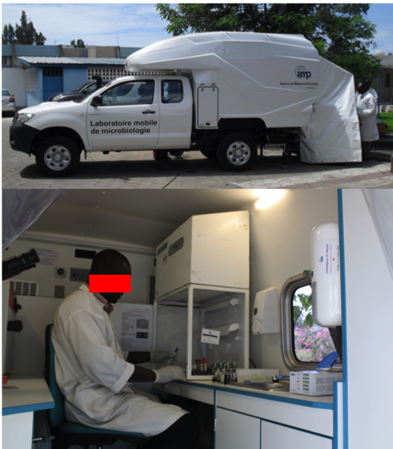
Figure 1. The exterior and interior of the LaboMobil®. doi:10.1371/journal.pone.0068401.g001

for Hi, lytA for Sp, siaD for Nm genogroups B, C, Y, X, and W135, and mynB for NmA. The Pasteur Institute, Paris, France performed molecular analysis according to European Meningococcal Disease Society (EMGM) recommendations [18,19] including PCR identification and genogrouping as well as testing for multilocus sequence typing (sequence type and clonal