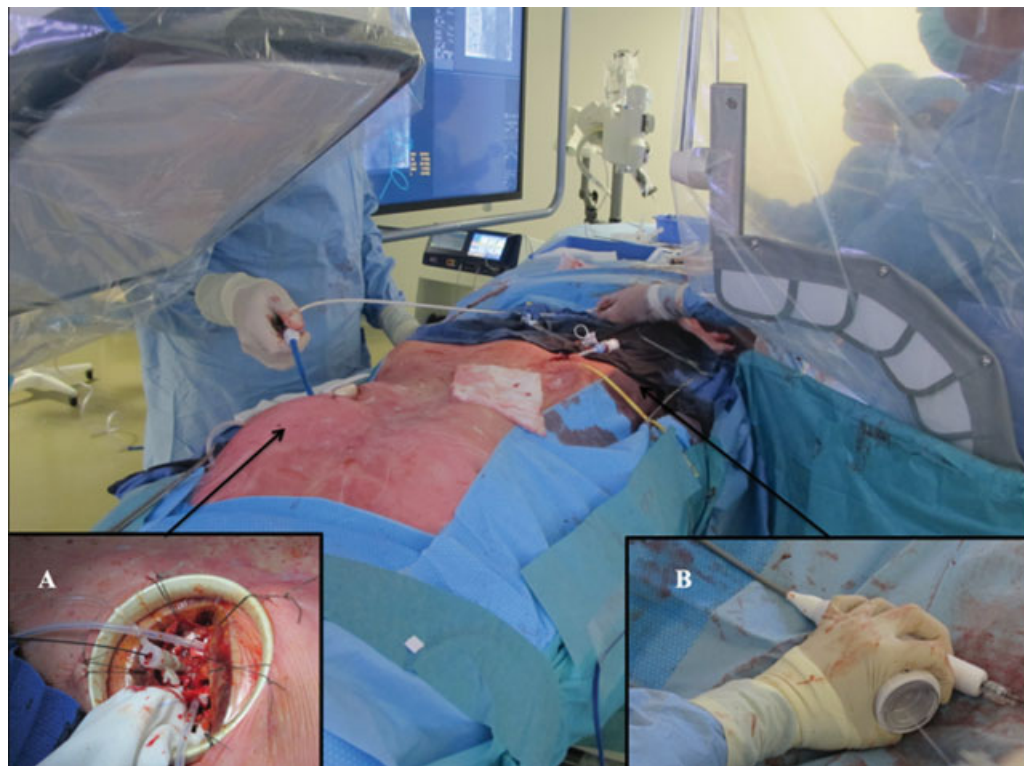
Fig. 2 Surgical view during the stent-assisted balloon induced intimal disruption and relamination in aortic dissection repair procedure through the left ventricular (LV) approach and the right femoral access for the endoprosthesis deployment. A Lunderquist stiff guide wire was introduced through the 18-F catheter from LV access (A) to the right femoral artery (B).