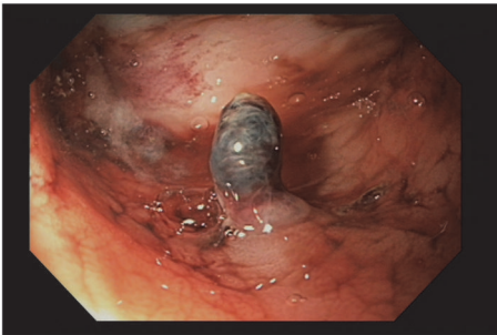
FIGURE 2: Endoscopic visualization of a single pulsatile artery protruding from the rectal mucosa consistent with a Dieulafoy's lesion.

emergent blood product transfusion. Her systolic blood pressure was less than 90 mmHg. Her heart rate was greater than 150 beats per minute. Laboratory findings demonstrated a hemoglobin decline from 8 g/dL to 5 g/dL (normal, 11.7-15.7). Her platelets were reported as 120 \times 10^9/L (normal, 150-440). Physical exam findings were significant for a large amount of bright red blood per rectum with passing of multiple large dark clots. She was given intravenous fluids and thirteen units of blood products with minimal improvement in hemodynamics. Mesenteric arteriography revealed active extravasation in the rectum. She underwent successful Gelfoam embolization (Figure 1).