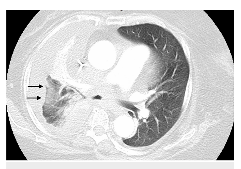
FIGURE 3: Follow up CT chest three months later showed compressive atelectasis of the right lung (arrows).

The patient was subsequently treated for pneumonia with antibiotics without any improvement in symptoms. A decision was made to stop TKI therapy and start palliative chemotherapy with carboplatin and etoposide. The patient's medical condition deteriorated rapidly and she opted for home hospice care.