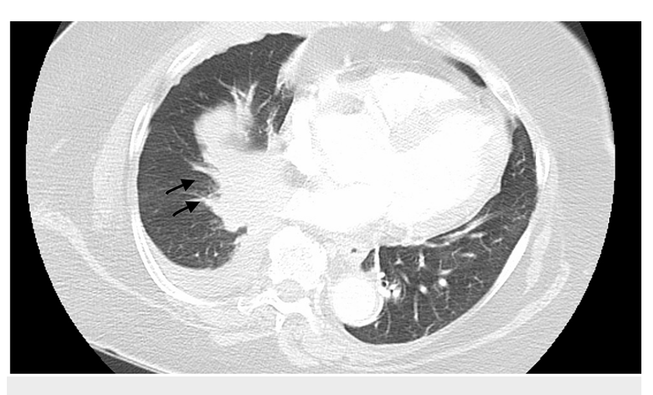
FIGURE 1: Initial CT chest with contrast showed hilar involvement of mass.

CT abdomen pelvis revealed a pancreatic mass. MRI brain showed several nodular densities suggestive of metastatic disease despite absence of symptoms (Figures 2A, 2B).