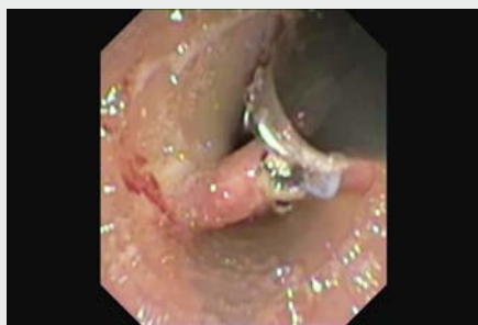
► Video 1 Procedure of Zenker diverticulotomy.

At 6 months, 33 of 36 (91.6%) reported remaining asymptomatic and 3 of 36 (8.3%) reported dysphagia for solid food, with one patient with little initial improvement and very fre-