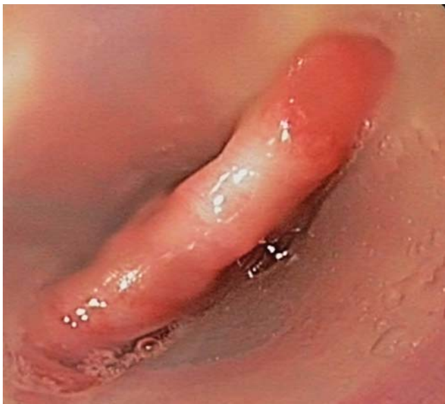
► Fig. 2 The esophageal-diverticular septum was isolated between the two blades after gentle advance of the diverticuloscope until the long blade fit into the esophageal lumen and the short blade into the diverticulum.