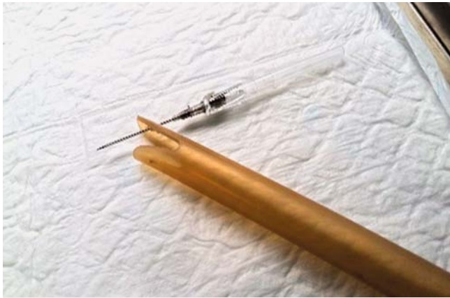
► Fig. 1 The external end of the guidewire inserted through a hole made through an 18G catheter at the end of the long blade of the plastic diverticuloscope (Cook Medical, Limerick, Ireland).