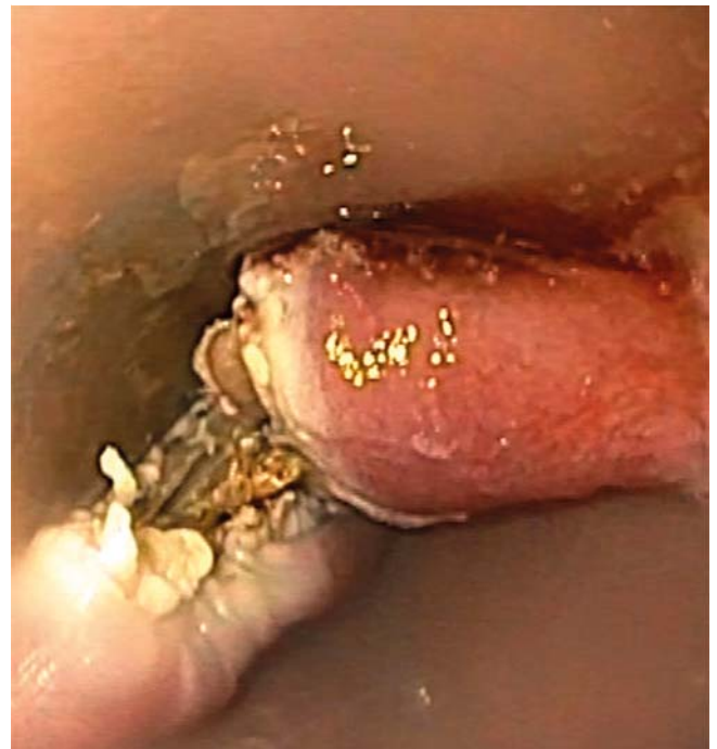
► Fig. 4 Appearance of the septum after cutting with Ligasure.

Most early complications were mild: odynophagia (21.5%) and cervical pain (5%) that resolved in <72 hours with first-level analgesia. However, two males (2.5%) presented iatrogenic esophageal microperforation in the first hours after treatment, requiring hospital admission for 8 and 12 days, respectively. These patients reported thoracic or interscapular pain and low-grade fever with leukocytosis, and small peridiverticular air bubbles were evident on computed tomography, despite placement of a clip in both cases. Neither required surgical or endoscopic procedures, and evolved well with conservative treatment that included fasting and antibiotic therapy. One pa-