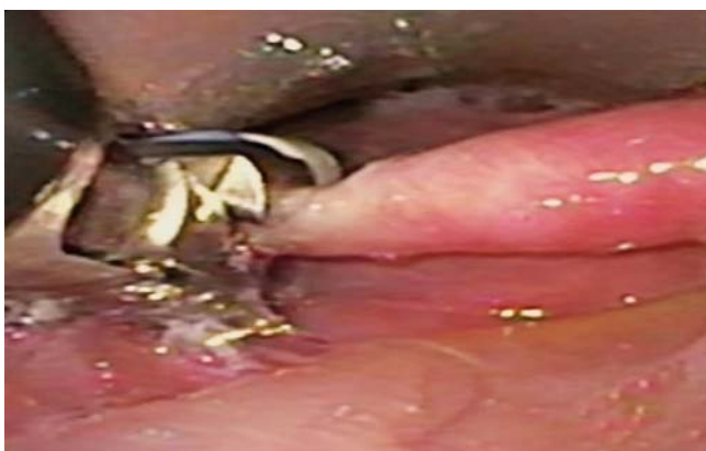
► Fig. 3 When the Ligasure reached the middle zone of the EDS, the blades were opened and closed on the tissue.

gasure (LS1500, Covidien, Medtronic, Minneapolis, Minnesota, United States), a system imported from laparoscopic surgery, has shown very good results in small series [8–10]. We present the largest series of patients with ZD treated by endoscopic diverticulotomy with Ligasure (EDVL) with a long follow-up.