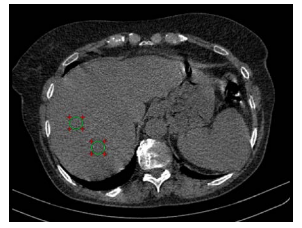
Figure 2. Representation of an axial non-contrast CT slice with the ROI positioned within hepatic segments VII and VIII.

The average of multiple liver density measurements was used to determine liver attenuation, this was performed by using 4 regions of interest (ROI) of 1.5cm diameter, two per slice at segments VII and VIII (Figure 2).