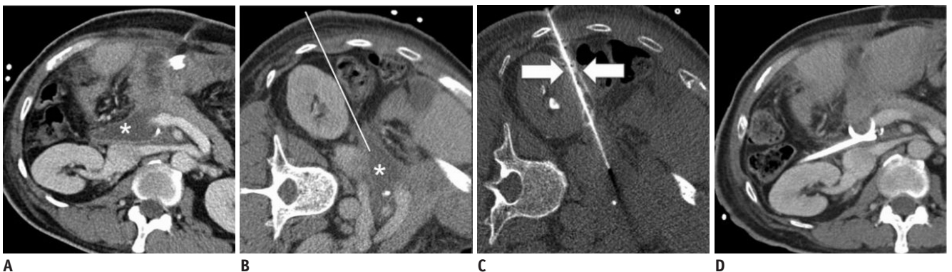
Fig. 1. Sixtyone year-old man with fever 7 days after pancreaticoduodenectomy. Contrast enhanced CT images (A) diagnostic (B) prior to drainage with patient in left decubitus position, shows abscess (*) in region of excised pancreatic head with overlying bowel loops and liver anteriorly. Planned trajectory in anterior pararenal space (white line) appeared narrow. (C) CT fluoroscopic image showing contrast-fluid hydrodissection (white arrows) widening space between right kidney and ascending colon to allow safe passage of needle. “Salinoma” was created by injecting contrast-fluid mixture continuously while advancing needle. (D) Contrast enhanced CT prior to drainage catheter removal, showing Cope loop of drainage catheter within surgical bed.

A 57 year-old man, who had pancreaticoduodenectomy 3 years prior to the distal common bile duct cancer, was found with a small hypodense 1.5 cm enhancing mass in the surgical bed on surveillance CT (Fig. 2A). Due to overlying