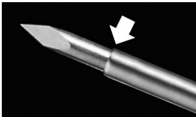
Appendix 1. Magnified photograph of tip of two part Trocar needle. Note diamond tip with blunt outer cannula (white arrow). Blunt outer cannula is very useful for hydrodissection as it atraumatic.