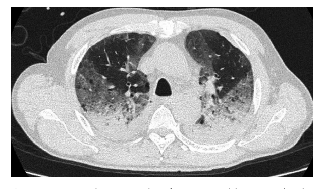
Fig. 1. Computed tomography of a 63-year-old man on the day of admission for respiratory failure due to COVID-19 pneumonia. The scan of the chest shows a crazy paving pattern.

After 5 days in the prone position, the patient's respiratory failure worsened; the partial pressure of arterial oxygen was 66 mmHg with ventilation settings of 16 cmH<sub>2</sub>O PEEP and 80% FiO<sub>2</sub>. Venous-venous ECMO was provided through the right jugular vein and right common femoral vein.