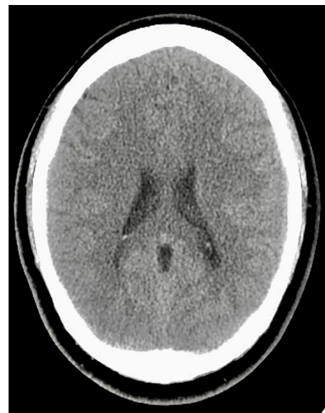
Image 1. Patient's non-contrast head computed tomography, with no acute abnormality.

It is crucial that emergency clinicians consider the effect of the planet's changing climate on the distribution of disease.