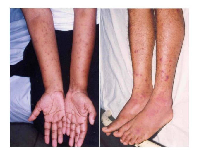
Figure 3. Erythematous or dusky red discrete skin rash in both upper and lower limbs involving hands and feet. doi:10.1371/journal.pntd.0003179.g003

Lesions were distinctively erythematous in fair skinned patients whereas those were more of dusky red in dark skinned patients. Furthermore, in some patients the rash was visible only if the skin was visualized from an angle in the daylight. Average size of a skin lesion was 5 mm and it ranged from 2–10 mm. The rash was always discrete with normal looking skin in between and the shape of the lesions varied. Commonly they were either ovular or round