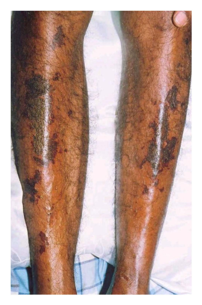
Figure 2. Fern leaf type skin necrosis in legs. doi:10.1371/journal.pntd.0003179.g002

Lesions were distinctively erythematous in fair skinned patients whereas those were more of dusky red in dark skinned patients. Furthermore, in some patients the rash was visible only if the skin was visualized from an angle in the daylight. Average size of a skin lesion was 5 mm and it ranged from 2–10 mm. The rash was always discrete with normal looking skin in between and the shape of the lesions varied. Commonly they were either ovular or round