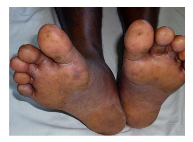
Figure 6. Vasculitic rash in toes and plantar surface of feet. doi:10.1371/journal.pntd.0003179.g006

earlier and the fern leaf type skin necrosis has not often been described other than in few studies done in the same region in Sri Lanka [2,4]. However, there are reports of gangrene of digits, ear lobes, scrotum, nose or limbs occurring in rickettsial infections such as RMSF [16,17] similar to two cases presented in 2012. Even though, the skin rash had a wide distribution in different regions of the body, majority had dominant involvement of arms, forearms and legs. Although the involvement of palms and soles are characteristic in rickettsial infections, only about 56% of this group had the rash involving palms and soles. Moreover, the study describes some important general characteristics basically seen in old aged patients. These include cutaneous oedema around the ankles and puffiness of face with the skin becoming dusky discolouration. Importantly, such focused descriptions are not found in earlier studies. Even though, majority of patients did not come for follow up, our experience suggests that cutaneous rashes take 2-3 weeks to fade off after defervescence. Furthermore, rash negative forms of rickettsial cases have also been described from Sri Lanka amounting to a smaller percentage [18].