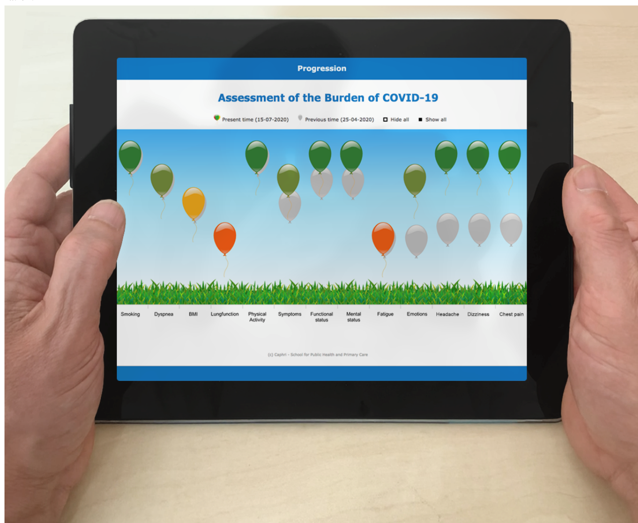
Figure 2. Visualization of the ABCoV tool. ABCoV: assessment of burden of COVID-19; FEV1: forced expiratory volume in the first second of expiration.