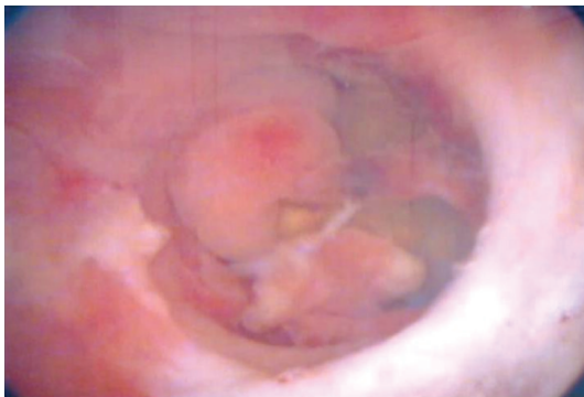
FIGURE 2: Preoperative cystoscopic evaluation of the resection area showing the rectal lumen following an iatrogenic rectal injury.