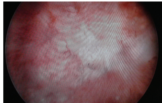
FIGURE 4: Postoperative cystoscopy with no fistula.

with vascular supply was placed between the rectum and bladder to enhance restoration. Broad-spectrum antibiotics were continued for 5 days after surgery. A liquid diet was started on postoperative day 1, and a regular low-fiber diet was started on day 3. Anal dilation was performed for fecal discharge. The patient recovered uneventfully and was discharged on postoperative day 4. The urethral catheter was removed on postoperative day 14 after normal cystographic findings (Figure 3). A urinalysis and cultures were negative during the first, third, and sixth months. Postoperative cystoscopy (Figure 4) was performed at the first month and then the patient was followed up for 6 months with the help of symptoms and urine tests. Normal urine tests and cessation of symptoms disclosed improvement of the fistula.