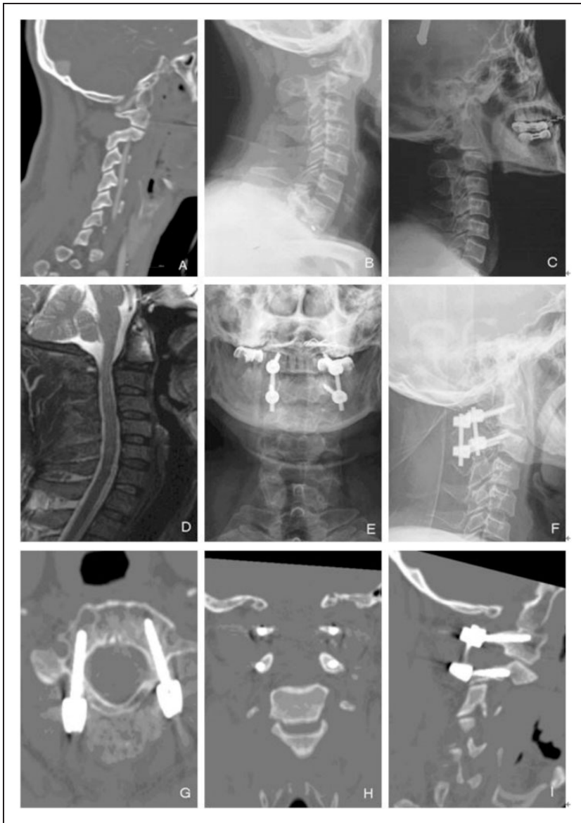
Figure 3. An example case study demonstrating a type I pedicle screw placement. A 47-year-old male patient presented with malformations of the C1 and C2 vertebrae, abnormal fusion, and atlantoaxial dislocation. Posterior relocation was achieved by fusing the atlantoaxial pedicle using fixed screws. (A) A preoperative sagittal computed tomography (CT) scan showed the height of the atlas posterior arch surface (2.5 mm; D1), as well as the height of the vertebral artery groove (3.7 mm; D2). (B) A lateral X-ray illustrated the C1 and C2 malformations, as well as the atlantoaxial dislocation. (C) Preoperative X-ray review after selecting the illustrated atlantoaxial relocation strategy (type I pedicle screw placement). (D) Magnetic resonance imaging scan showed cervical abnormality and instability, as well as partial bone contusions. (E, F) Postoperative lateral X-rays illustrated that the atlantoaxial dislocation was reset, and the pedicle screw fixation was successful. (G) A postoperative axial CT scan illustrated that the atlas pedicle screw was placed accurately. (H) A postoperative coronal CT scan showed that the atlas pedicle screw was located at the cross section of the lateral pedicle. (I) A postoperative sagittal CT scan illustrated that the pedicle screw placement was under the posterior arch.