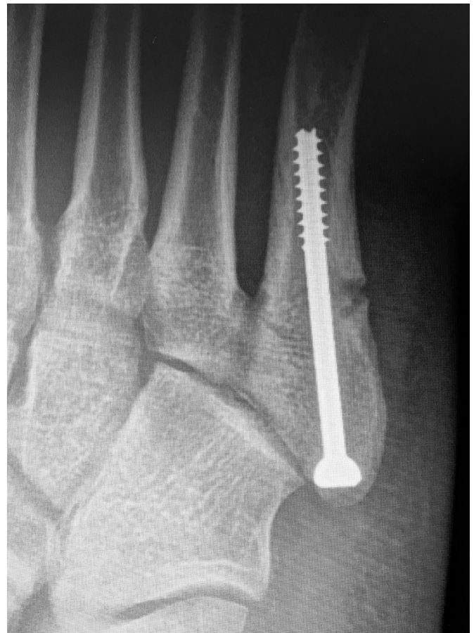
Figure 1 X-ray of one players' fifth metatarsal stress fracture (insidious onset) after surgical fixation with an intramedullary screw. Note location distal to the tuberosity where traumatic avulsion fractures occur.

Healthy matched control participants were injury-free for 6 months prior to the study with no previous history of injury to MT-5 or anterior cruciate ligaments. Healthy participants were matched for playing position, body mass, height and level of competition.