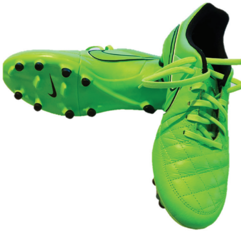
Figure 2 Firm ground football shoe used by all participants (Nike Tiempo Genio II).

are placed bilaterally with no foot orthotics in place so that the Pedar-X insoles were flat. A global positioning system (GPS) with accelerometer (Catapult, Australia) was used to verify running speed of the trials.