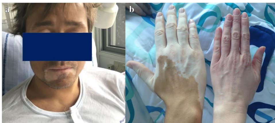
Fig. 1 A, B Hypopigmentation and hyperpigmentation in a patient with hypothyroidism. The patient had characteristic physical appearance with both hypopigmentation due to his vitiligo and hyperpigmentation due to excessive ACTH production preceded by the cleavage of the prohormone, pro-opiomelanocortin (POMC) leaving

Physical examination showed poor general appearance, white patches on multiple areas of the skin, hyperpigmentation in the remaining skin areas (Fig. 1A and 1B), and slight activity-related dyspnea. The patient's blood pressure was