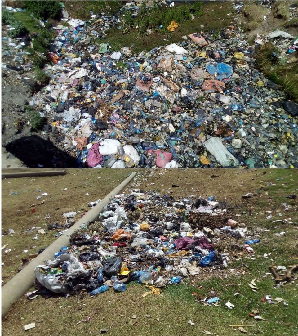
Figure 3. Waste disposed of in ditches and roadside of Fiche town.

of the respondents were aware that improper waste management leads to disease; such as diarrhea and malaria in Malaysia. 5 A possible explanation for this could be the lack of awareness on the danger posed by improper solid waste disposal in the Fiche town.