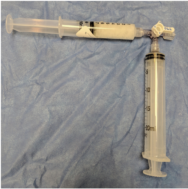
Fig. 2 – Gelfoam slurry preparation: Gelfoam is torn into small pieces and placed into one syringe. The other syringe is then filled with 5 to 10 mL of normal saline. Both syringes are attached to a three-way stop cock and the slurry is mixed by alternating contents between syringes.