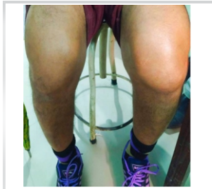
Figure 1: Clinical picture of the patient showing swelling of the left knee.