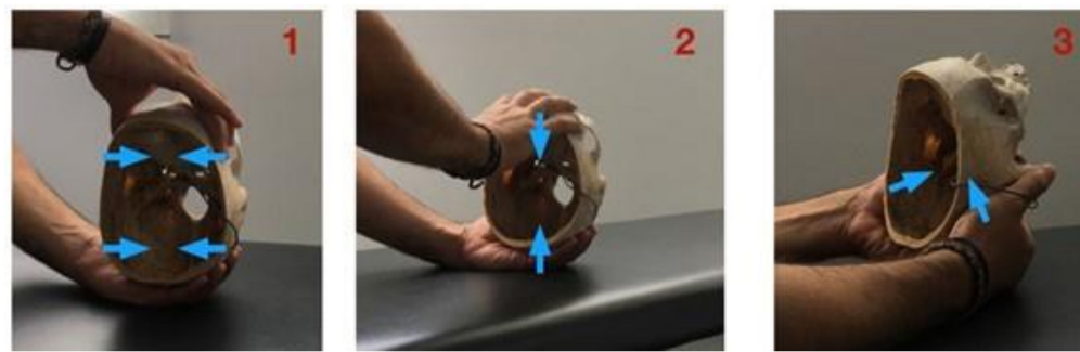
Figure 2. The different maneuvers were carried out for the evaluation of the study. (1) Lateral compression manoeuvre, (2) anteroposterior compression manoeuvre, and (3) compression manoeuvres of the mastoids.