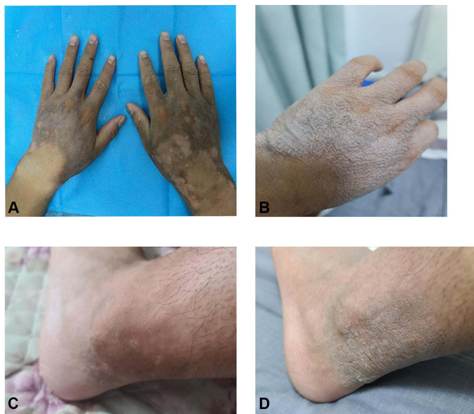
Figure 2 White maceration after immersion in water for five minutes (A–D).

Histopathological findings showed hyperkeratosis of the skin, thickening of the stratum spinosum and mild perivascular lymphocytic infiltration in the papillary layer of the dermis (Figure 3).