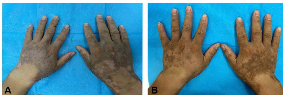
Figure 4 Topical use of Hirudoid twice a day for a month and symptoms were partially relieved ( A and B ).

was proposed. 7 As several cases of SAK have been reported from China, India and Japan in subsequent years, so has the discussion about naming it. Synonyms used when referring to this rare entity include pigmented carpotarsal hyperkeratosis, hyperkeratosis nigricans carpi et tarsi, and pigmented aqua-exacerbated symmetrical acral hyperkeratosis. 6–8 However, some scientists think the term “pigmented aqua-exacerbated symmetrical acral hyperkeratosis” is better than “SAK” or “pigmented carpotarsal hyperkeratosis” because they hold the opinion that any proposed nomenclature should adequately describe these characteristic clinical features and the natural history of this disorder. 8