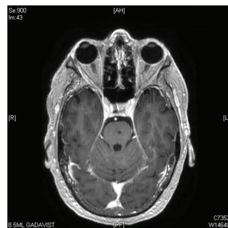
FIGURE 3: Posttreatment axial MRI image of the pons with complete ablation of the pontine metastasis and no further visible disease within the brainstem.