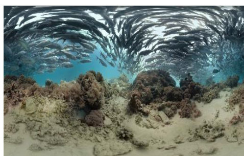
Figure 1. Example stills from each of the 30-second 360° video clips.

The 360° video was played on ZTE Axon 7 smartphone, placed inside a Google Daydream™ VR headset to allow fully panoramic viewing. The smartphone screen had a resolution of 1440 × 2560 pixels (Quad High Definition (QHD)). The smartphone was linked through a wireless connection to a Vodafone N8 Smart Tab 4G tablet using the Showtime VR app, from which the researcher could control the 360° video remotely. This allowed for a more seamless transmission, in which the researcher and carer (where present) could follow the 360° video content on the tablet screen in ‘real time’, enabling a shared experience. The Daydream headset (Figure 2) was fitted with wipe-clean face cushions which were cleaned with alcohol wipes between individual sessions, and laundered between café visits.