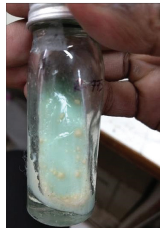
Figure 1: Lowenstein Jensen media slant showing typical rough, tough, and buff colonies of Mycobacterium tuberculosis

Inoculated LJ media were examined daily for 5–7 days to detect rapidly growing mycobacteria and for any contamination. As soon as any growth was evident, showing typical rough, tough, and buff colonies of M. tuberculosis [Figure 1], smear was made and stained with ZN staining for confirming AFB. All the positive cultures were further examined for the rate of growth, pigmentation, and other biochemical properties, namely, niacin production, nitrate reduction, and catalase test for confirmation of M. tuberculosis . Development of canary yellow color was taken as positive for niacin production test, whereas no color change was taken as negative [Figure 2a]. For nitrate reduction test, development of red or pink color was taken as positive and no color change as negative [Figure 2b]. For catalase test, production of bubbles was measured [Figure 2c]. All the isolates with niacin production, positive nitrate reduction, and catalase positive were labeled as M. tuberculosis . The MGIT vials once flagged positive by the automated system were confirmed by ZN staining to confirm the presence of AFB. Cultures found AFB positive by microscopy were identified by MGIT TBc identification test (TBc ID; Becton Dickinson, Sparks, MD), a rapid immunochromatographic test that detects M. tuberculosis complex MPT 64 protein. [16,17]