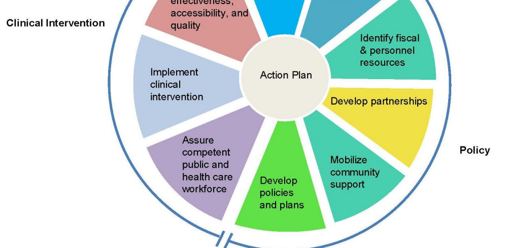
Figure 2. Essential public health functions framework.