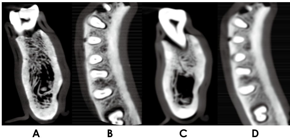
Fig. 1. Cone-beam computed tomographic (CBCT) images before 3-dimensional analysis. A and B. CBCT_HI images. C and D. CBCT_Std images.

Table 1 shows the mean \pm SD, minimum, and maximum measurements of BV, BV/TV, BS, TbTh, TbSp, TbN, TbPf, and SMI at different voxel sizes (Std and HI) in both imaging modalities (micro-CT and CBCT). The BV, BV/TV, and TbTh values were higher for CBCT images than for micro-CT images, whereas the BS, TbSp, TbN, TbPf, and SMI values were lower in CBCT images than in micro-CT