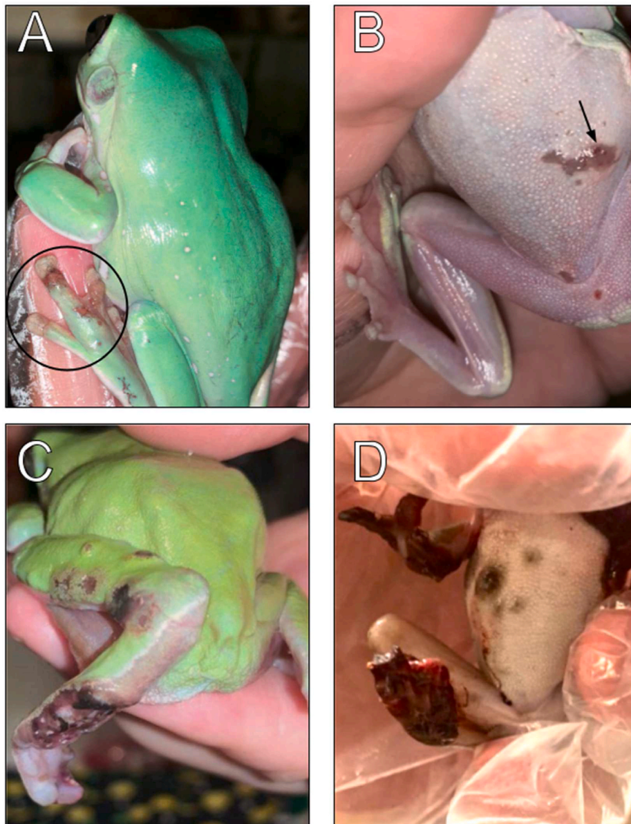
Fig. 1. (A-D). Gross findings in White's tree frogs suffering from phaeohiphomycosis associated with V. botryosa . Gross findings from presumptive (A, B) and confirmed (C, D) cases of phaeohiphomycosis caused by V. botryosa in affected White's tree frogs ( L. ceruleae ). A.) Multifocal ulcerative dermatitis of the pes (Case 5) (circle). B.) Well-demarcated ulceration of the ventrum (Case 5) (arrow). C.) Multifocal ulcerative dermatitis with deep necrosis and exposure of flexor tendons (Case 1, prior to amputation). D.) Extensive hemorrhagic necrosis of multiple distal extremities and ulcers on the ventral abdomen (Case 6, deceased).

The formalin-fixed carcass was emaciated. Both mani and the single fixed pes were markedly swollen and red-to-black. Thick necrohemorrhagic exudates obscured digital detail. There were multiple variably