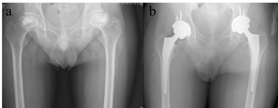
Fig. 1 The anteroposterior radiographs of bilateral hip joints before (a) and after (b) bilateral total hip arthroplasties. a Radiograph taken 2 days before THA showed bilateral femoral head collapse and secondary osteoarthritis, which indicated ARCO IV stage osteonecrosis of the femoral head; (b) radiograph taken immediately after bilateral THA showed satisfactory location and fixation of bilateral femoral and acetabular prostheses

Since the patient was vulnerable after the last operation, a bilateral revision of total hip arthroplasty was performed in one session on the 21st day after THA when the patient's condition has stabilized, with anti-epileptic drugs and prednisolone continuing to be administered before revision. The posterolateral approach was followed on both sides. The right hip surgery was performed first: after removal of the femoral prosthesis, fracture flats of the proximal femur were restored and fastened with three titanium cables; then a new set of non-cemented long-stem prosthesis (DePuy) and 36-mm ceramic head was installed, and the dislocated hip joint was reduced. As to the left hip joint, since the superior acetabular bone was defective, an allogeneic femoral head was trimmed and fixed to the region of bone loss by using three cannulated screws. Acetabulum being carefully polished, a new porous 54-mm PINNACLE acetabular cup (Depuy) was placed and fixed with 4 cancellous bone screws; then a 36-mm highly cross-linked polyethylene lining was embedded and dislocated femoral head was reduced.