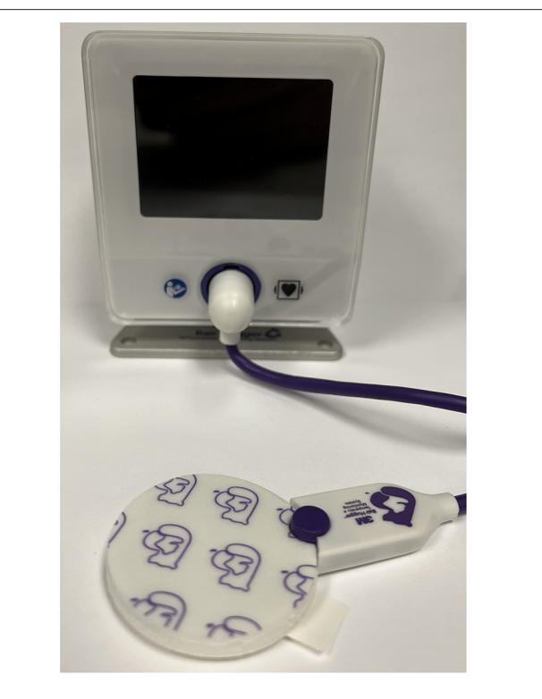
FIGURE 2 | 3M^{TM} Bair Hugger<sup>TM</sup>. Temperature sensors are applied to the patient's forehead.

Microwave thermometry uses microwave frequencies to measure electromagnetic radiation occurring throughout