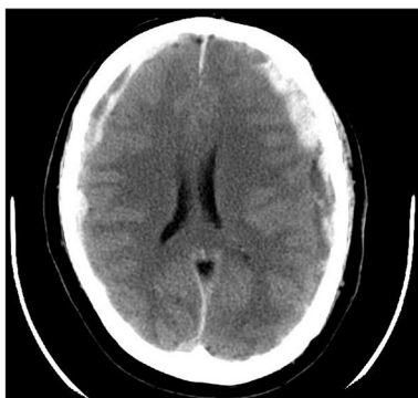
Figure 3: CT scan showed bilateral ASDH

In the fourth hospitalization day his coagulation parameters were INR = 1.40, activated partial thromboplastin time (aPTT) = 34.4 s., fibrinogen = 663 mg/dl, platelet = 114000/mm 3 . Because of consciousness falling, he retried a CT scan that showed an increase of the hematoma. For these reasons he was immediately treated with a neurosurgical operation.