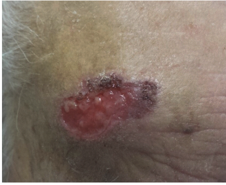
FIGURE 1: Squamous cell carcinoma presenting on forehead in the form of enlarging ulcer.