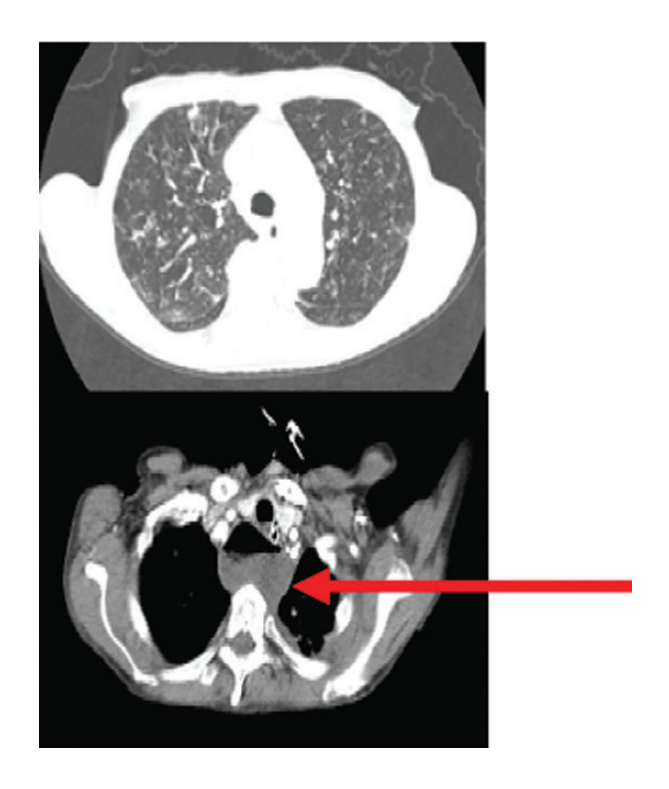
Figure 3. Thoracic computed tomography scan of case 1 patient showing bullae, interstitial abnormalities, fibrosis, and a cystic mediastinal abnormality (arrow).

died from respiratory failure. We obtained permission for an autopsy. Lung tissue culture yielded Candida species. Therefore, we consider this a proven Candida pneumonia.