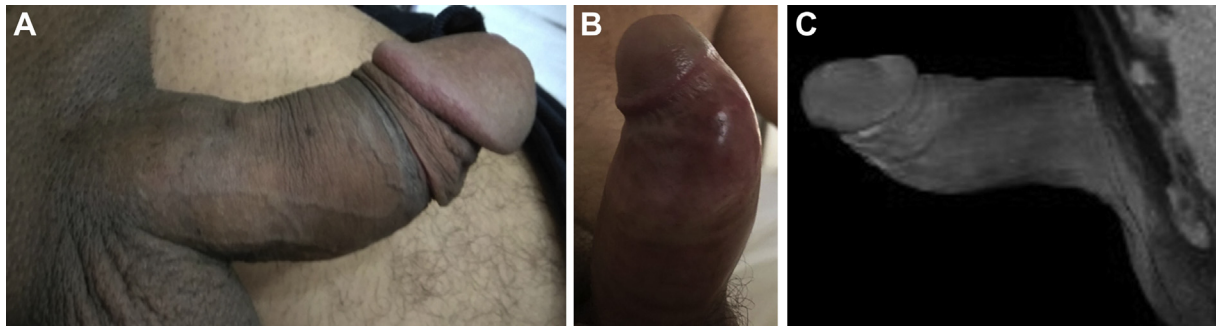
Figure 1. Panel A shows auto-photograph of a patient with Peyronie's disease (PD). Panel B shows assessment of PD with goniometry after intracavernosal injection. Panel C shows computed tomography scan of a patient with PD.