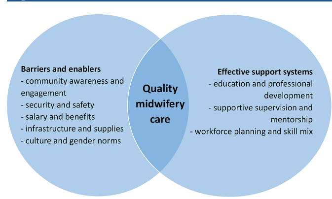
Figure 2 Barriers and enablers and effective support systems for quality midwifery care in humanitarian and fragile settings.

the International Confederation of Midwives standards and scope of practice for the midwives in their reporting.