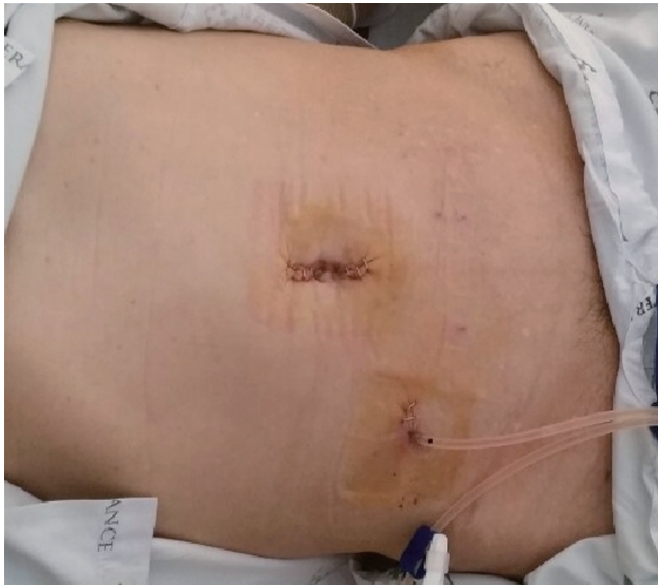
Fig. 3. View of the patient on postoperative day 1. The additional port site was used for pelvic-drain placement.

time of surgery to ensure an intact anastomosis. At the end of the operation, the additional port site was used for pelvic drain placement (Fig. 3).