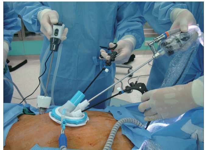
Fig. 1. Trocar and device placement: a 5-mm access channel for the single port and an additional port were used for the operating surgeon, and one of three 5-mm access channels was used for the assistant surgeon.

For bowel preparation, colonic lavage using 4 L of Colyte was performed on the day before the operation. Patients were given prophylactic antibiotics. All surgical procedures were carried out under general anesthesia with the patients in the lithotomy posi-