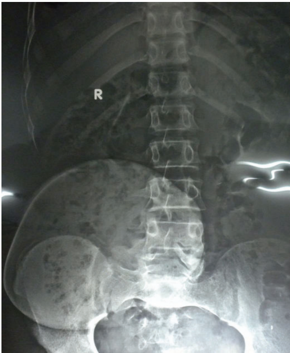
Figure 2 Radiograph showing the well-defined outline of the teratoma.

performed to establish the extent of the tumor. MRI of the lumbosacral spine revealed a well-defined lesion in the midline extending to the right gluteal region in the subcutaneous plane from approximately the L3-L4 to the S4 vertebrae and crossing the midline. It was further observed that the tumor was hyperintense on T1-weighted images and hypointense on T2-weighted images, which was