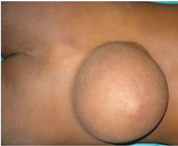
Figure 1 Photograph showing the teratoma in the lumbosacral region.

performed to establish the extent of the tumor. MRI of the lumbosacral spine revealed a well-defined lesion in the midline extending to the right gluteal region in the subcutaneous plane from approximately the L3-L4 to the S4 vertebrae and crossing the midline. It was further observed that the tumor was hyperintense on T1-weighted images and hypointense on T2-weighted images, which was