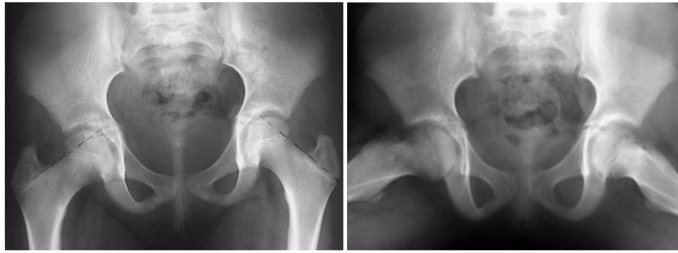
Figure 1: X-ray of hips without any abnormality.

femoral head (Fig. 2). MRI showed, in the coronal plane with fat saturation, a low-intensity signal on T1- and T2-weighted spin echo images in the right femoral head. The lesion was linear, regular, and not enhanced with contrast injection. There was no intra-articular effusion, no soft tissue and no acetabular abnormalities. The diagnosis of stress fracture of the femoral head was established (Fig. 3).