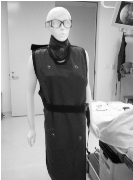
Fig. 1. Mannequin with dosimeters.