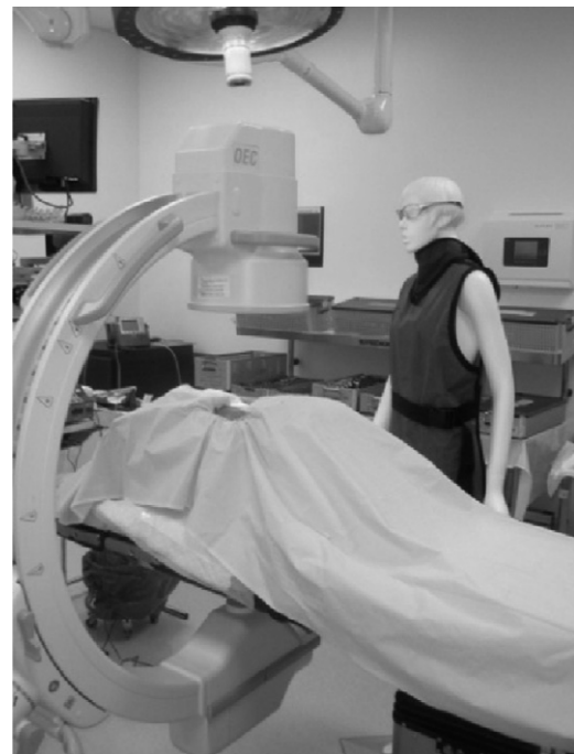
Fig. 3. Standard setup: lateral image.