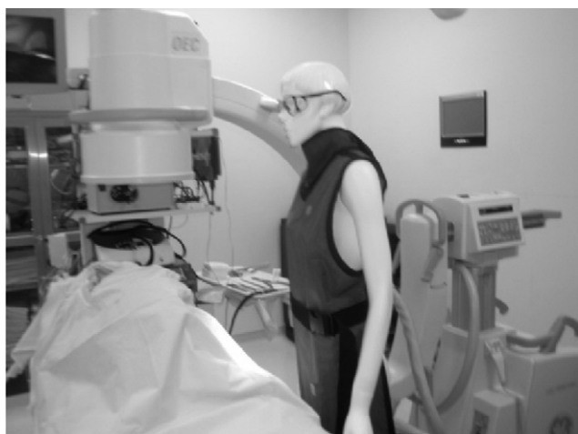
Fig. 4. Reversed setup: lateral image.

Abbreviations: RS, reversed setup; SS, standard setup; SSP, standard setup in pulsed mode.