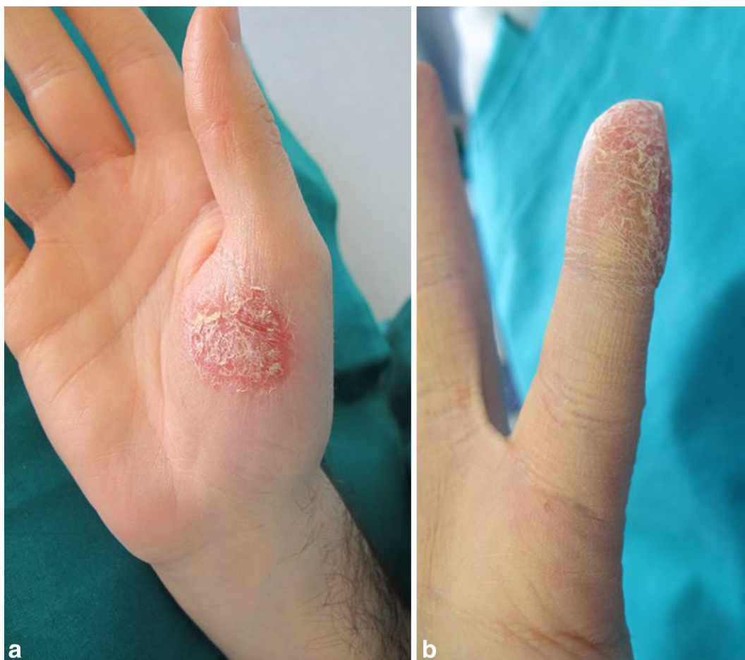
Fig. 3 Erythematous and desquamative plaques with pustules developed on the thenar eminence of the right hand (a) and fifth fingertip of the left hand (b)

localizations. Indeed, unlike keratinized stratified squamous epithelium of the skin, the transitional and mucosal epithelia do not contain corneodesmosin, an epidermal glycoprotein involved in keratinocyte adhesion, an allelic variant of which has been strongly associated with the development of psoriasis [8, 10]. It is well known that traumas, stress and streptococcal infection can precipitate psoriasis; therefore mild traumas, e.g., chronic friction from protruding teeth, or environmental changes in infection can lead to psoriatic lesions on the lips, especially in a genetically predisposed subject [9, 11].