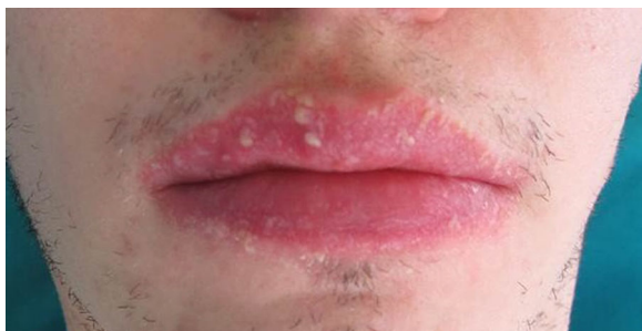
Fig. 1 Erythema, edema and scaling with small pustular lesions of the lips

otherwise normal, and the oral mucosa, tongue and nails did not present any lesions (Fig. 1).