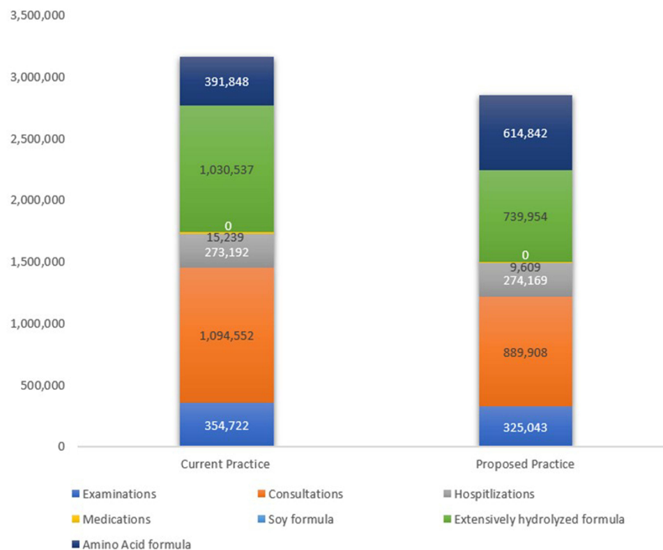
Figure 2 Cost breakdown of AAF use in current and proposed practice in Kuwait.

Abbreviations: AAF, Amino Acid Formula; KSA, Kingdom of Saudi Arabia; SAR, Saudi Riyal.