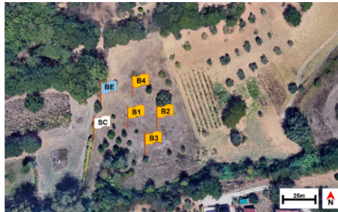
Figure 1. Satellite view (Google Earth) of the experimental site showing the rural area where the pig carcasses were positioned (Flags). SC, position of carcass set above the soil; B1–B4, positions of buried carcasses exhumed only once; BE, position of periodically exhumed carcass.

with a digital thermometer with a probe (IHM Moineau Instruments, Boutonne, France) every day, during the experimental period, each hour from 9 a.m. to 5 p.m., at 10-cm depth. The average of data of soil temperature are shown in Figure 2. Daily data about mm of rainfall were provided by ARPACAL pluviometer station (website http://www.arpacal.it/ ; accessed on 7 August 2020), referring to station Cosenza 118 (cod. 1017) (Figure 3).