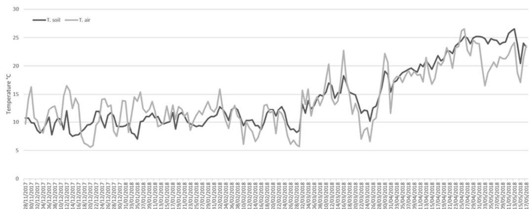
Figure 2. Data of soil (T. soil) and air temperature (T. air) and recorded at the experimental site from 28 November 2017, to 17 May 2018. Data are expressed as average of daily measurements at each hour from 9 a.m. to 5 p.m. Soil temperature data were measured with a manual probe every day, each hour from 9 a.m. to 5 p.m., at 10-cm depth above carcass B4. Air temperature data were provided by Centro Funzionale Multirischi—ARPACAL (Catanzaro, Italy), station Cosenza 118.