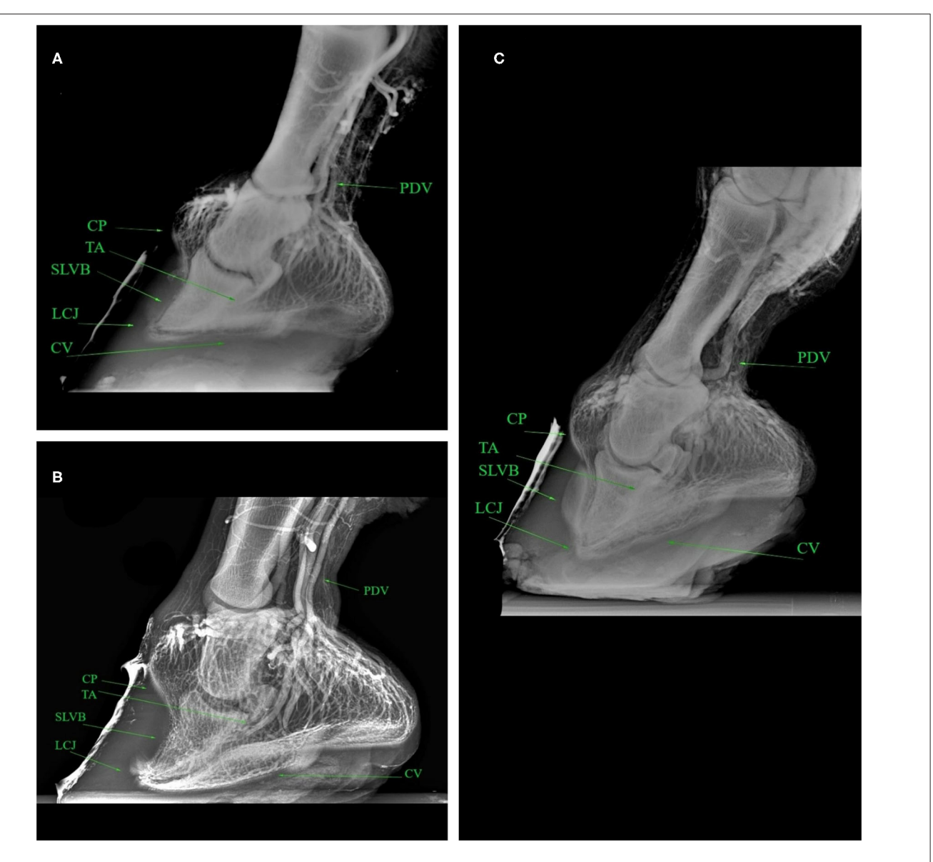
FIGURE 2 | Latero-medial venograms of healthy (A), mild (B), severe (C) laminitic donkey feet. PDV, Palmar Digital Vein; CP, Coronary Plexus; TA, Terminal Arch; SLVB, Sublamellar Vascular Bed; LCJ, Lamellar-Circumflex Junction; CV, Circumflex Vessels.

to be permanently distorted and so contrast may be reduced (10, 24).